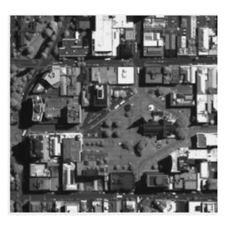
Fig 2.(a) ,(b) Gray Scale Low Resolution input Images.(c),(d) DWT & Bicubic interpolation images , (e),(f) are Optimized wavelet decomposition and bicubic interpolation images

In this section, DWT-SDS and bicubic interpolation method is compared with DWT and bicubic interpolation